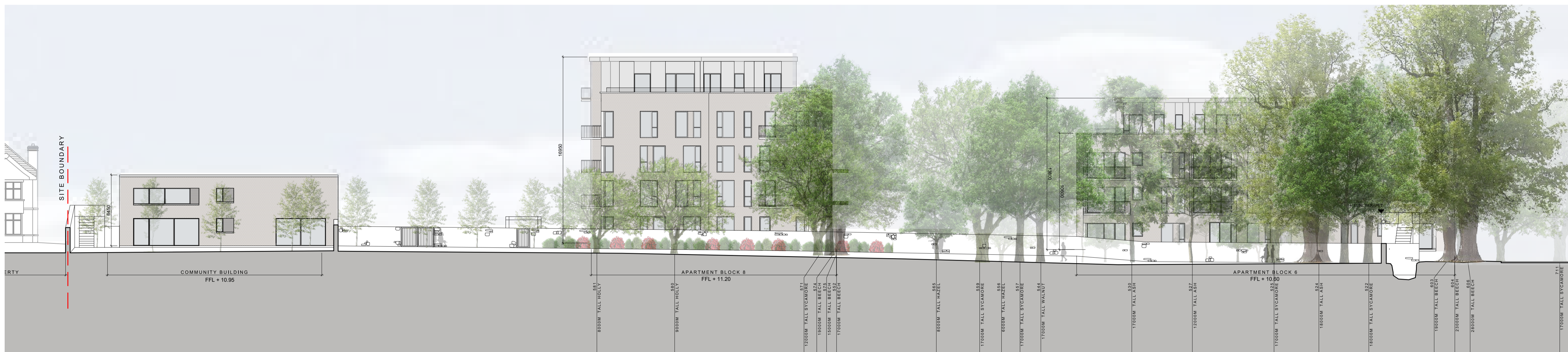
SITE SECTION B - B SCALE: 1:200 NOTE: SEE LANDSCAPE ARCHITECTS DRAWINGS FOR BOUNDARY TREATMENTS SEE ARBORISTS REPORT FOR DETAIL ON EXISTING TREES DOTTED RED LINE INDICATES SITE BOUNDARY