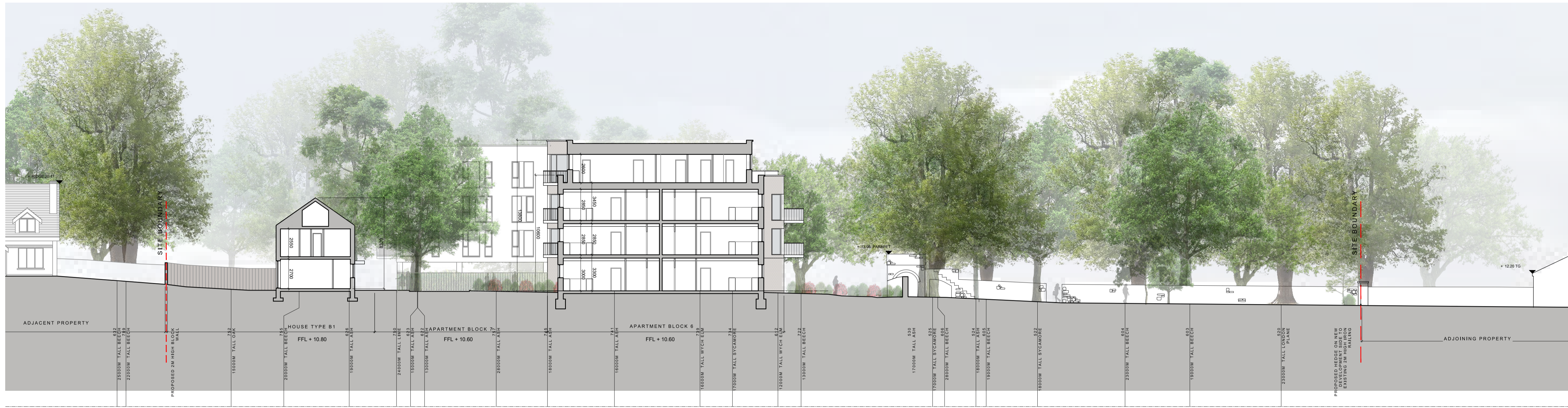
SITE SECTION A - A SCALE: 1:200 NOTE: SEE LANDSCAPE ARCHITECTS DRAWINGS FOR BOUNDARY TREATMENTS SEE ARBORISTS REPORT FOR DETAIL ON EXISTING TREES DOTTED RED LINE INDICATES SITE BOUNDARY